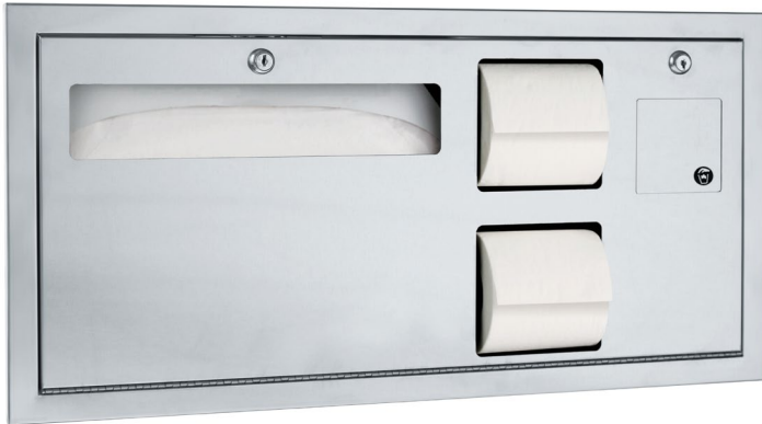
Shown above: 0487-R; below: 0487-L